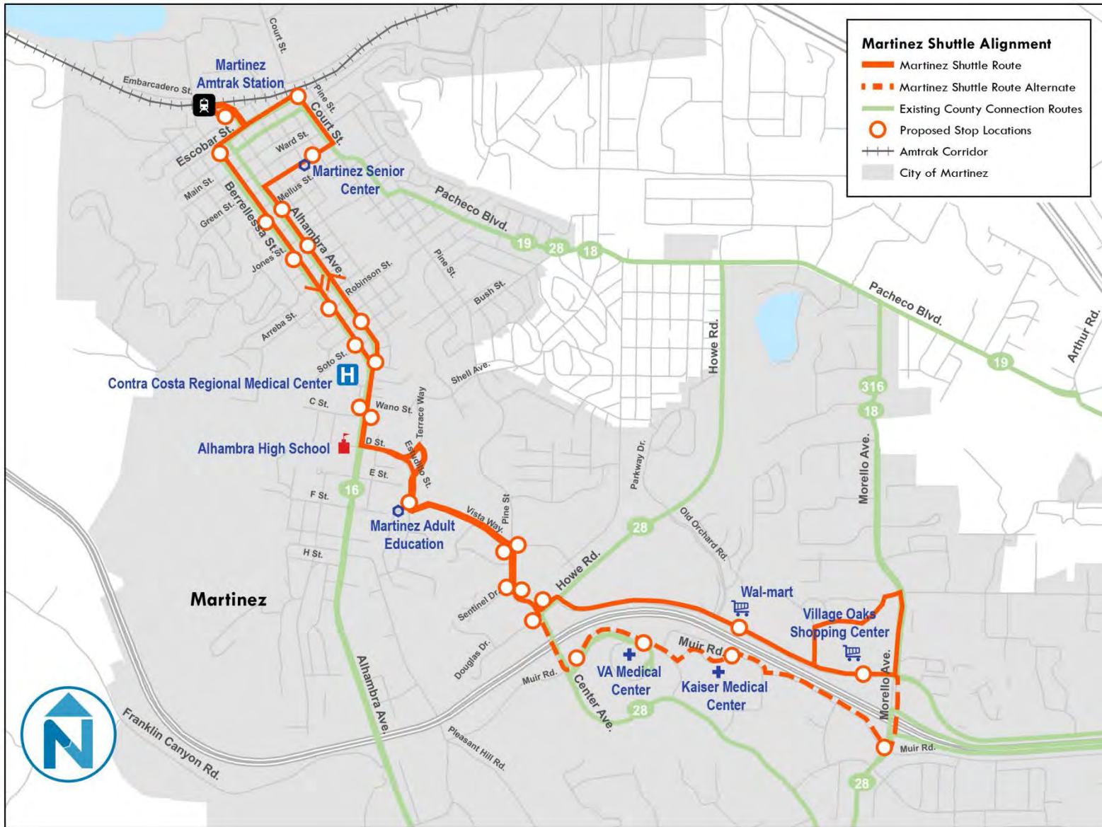
Figure ES-4 Martinez Community Recommended Shuttle Routing