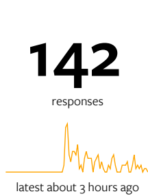
Time of Day

Waysign Pilot Program (/campaigns/400) > Waysign Real Time Feedback