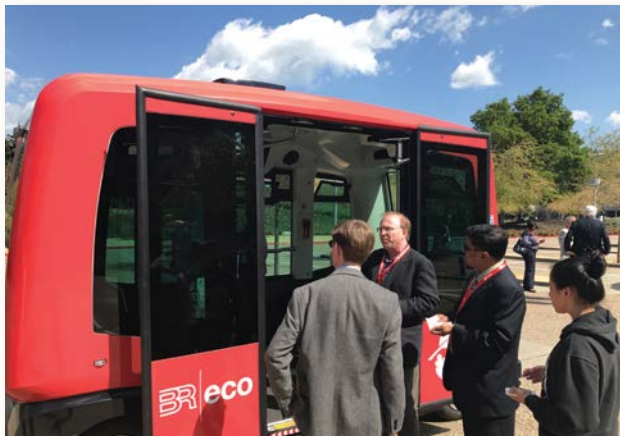
Bishop Ranch SAV test site 2017

In conclusion, AB 1444 (Baker) is needed to continue the momentum of forward thinking projects already underway, to encourage technological innovation in the field of public transit and to create jobs for California residents.