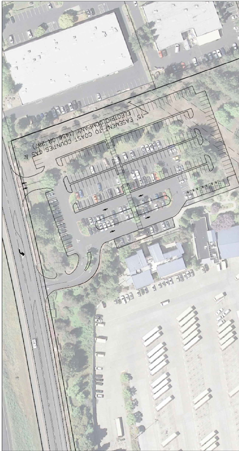
Proposed Parking Lot Configuration