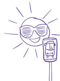
All Summer Long