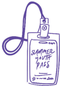
Get Your Pass