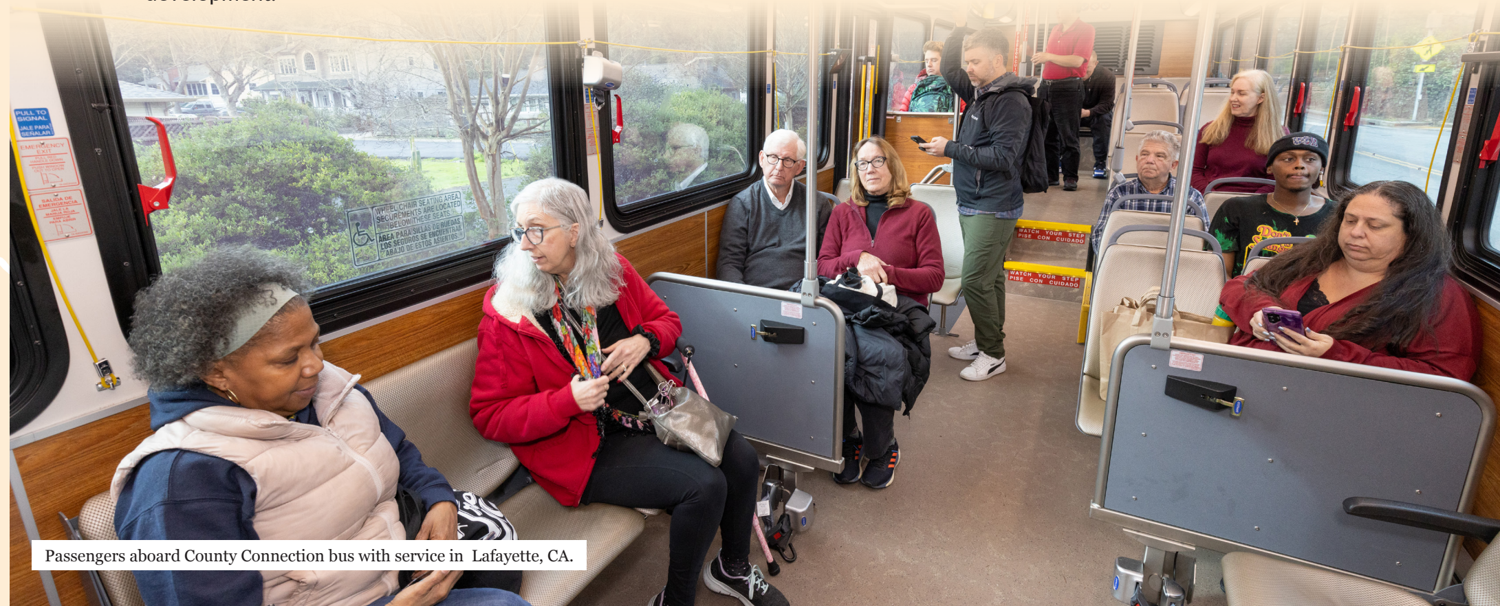
Passengers aboard County Connection bus with service in Lafayette, CA.

A continued vital partnership with the Contra Costa Transportation Authority and Livermore-Amador Valley Transit Authority to secure funding through Directed Congressional Spending will allow County Connection to pursue projects of benefit and application to our mission.